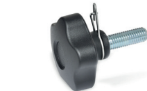
GN 5337.2 → Page 561 GN 5337.7 → Page 563 Size 32 ... 63