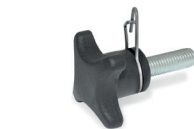
GN 6335.4 → Page 587 GN 6335.5 → Page 587 Material ST